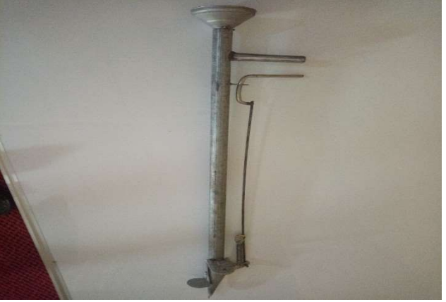
Albit Display Room